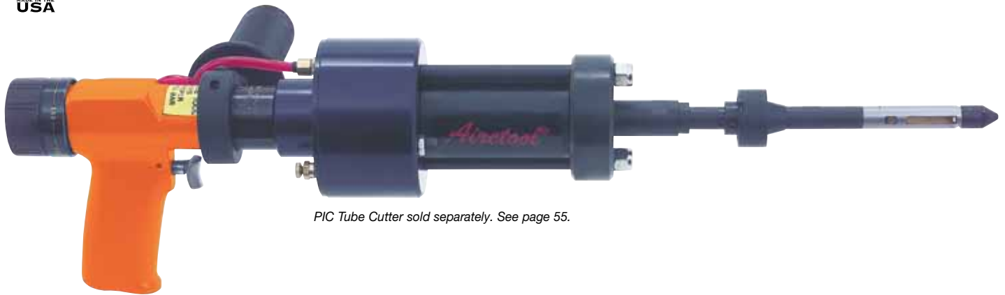
PIC Tube Cutter sold separately. See page 55.