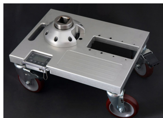
41013 HYDP-RD test stand